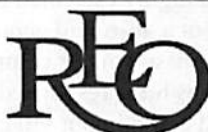
1909 REO Runabout