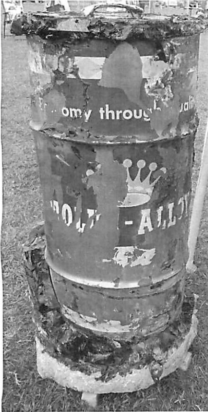
1868 Time Capsule