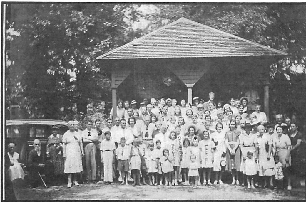
Smith Family Reunion, Williamston, SC. 1910.

Faith Clayton Room Southern Wesleyan University Rickman Library P.O. Box 1020 Central, SC 29630