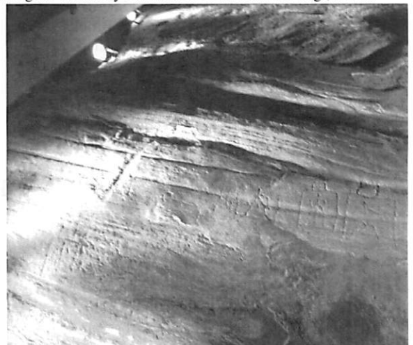
Petroglyph Exhibit.