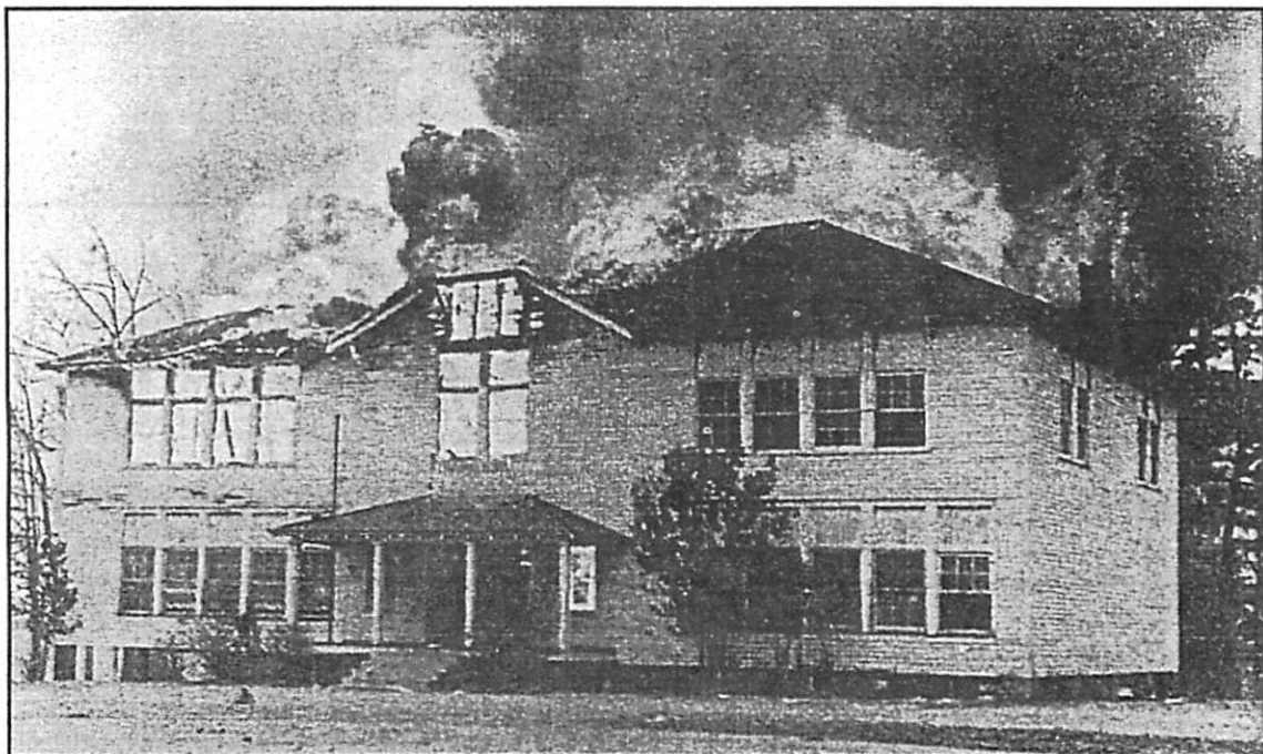
Burned March 11, 1959