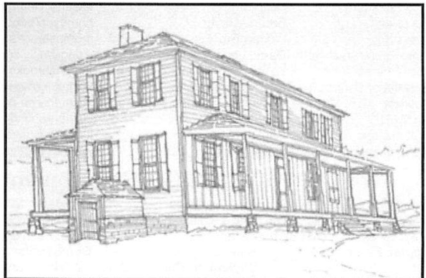
One of the sketches of Hopewell Plantation house after several additions.