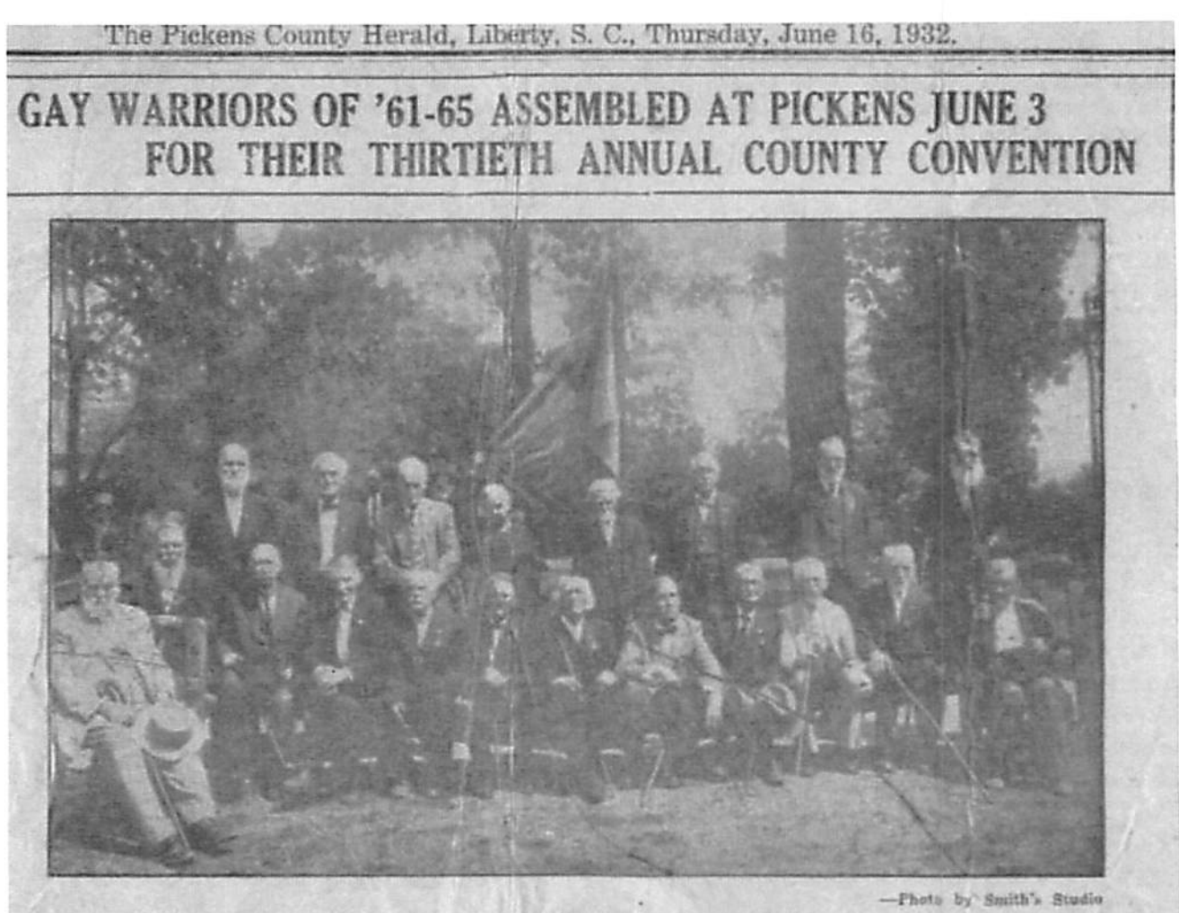
GROUP OF CONFEDERATE VETERANS SNAPPED AT THIRTIETH ANNUAL REUNION AT PICKENS, S. C. JUNE 3, 1932