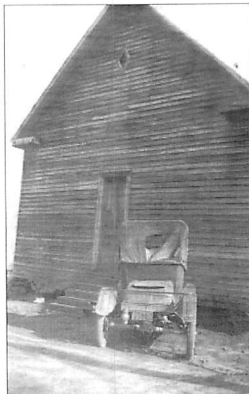
This is the second building for Mt. Bethel Methodist Episcopal Church which stood from 1896 to 1932.