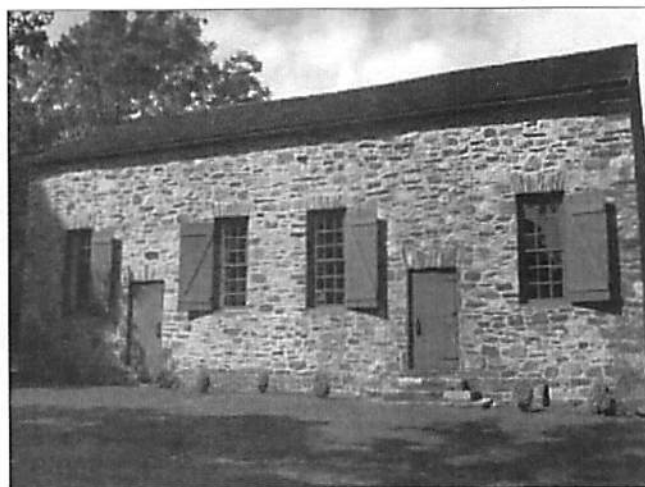
Old Stone Church is listed on the National Register of Historic Places. Both General Andrew Pickens and Colonel Robert Anderson are buried in the cemetery as well as many members of their families.