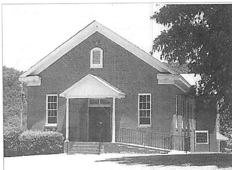
Mt. Bethel Church before the steeple was added.