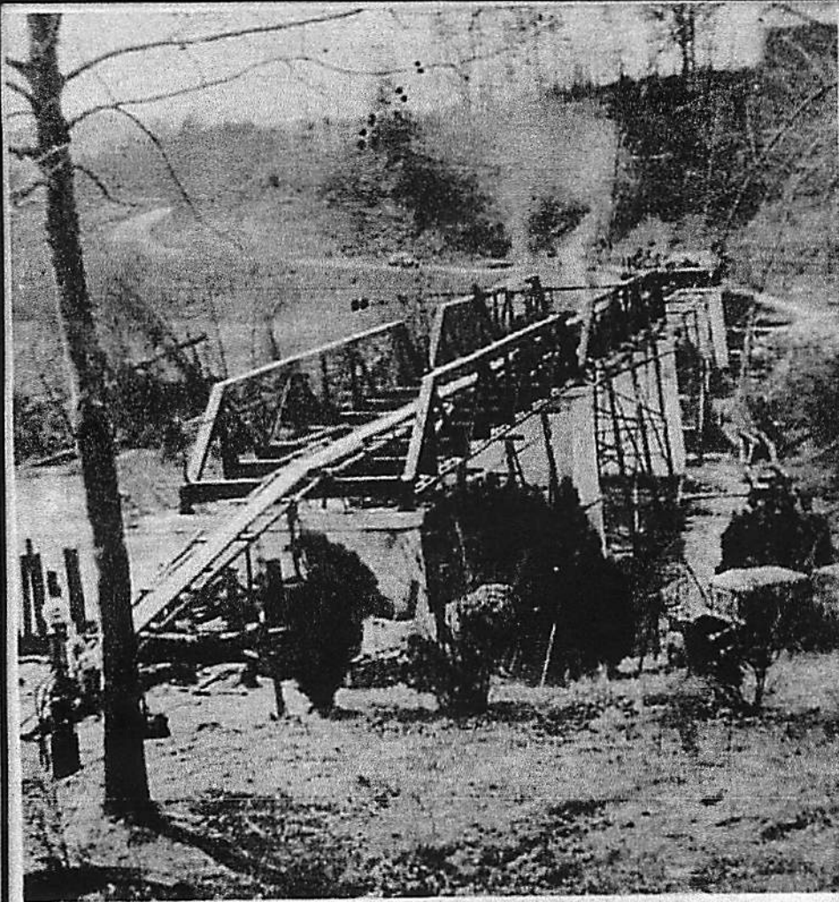
OLD PICKENS BRIDGE! Here's one of the earlier bridges under construction at Old Pickens. Note the Presbyterian Church up on the hill.

Pickens Sentinel Newspaper, Centennial Issue, September 30, 1968