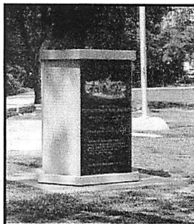
Revolutionary War Monument in Elberton, GA