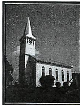
St. John's Lutheran Evangelical Church Walhalla, South Carolina

Dues Must be Paid Before January 15 to receive Carolina Herald