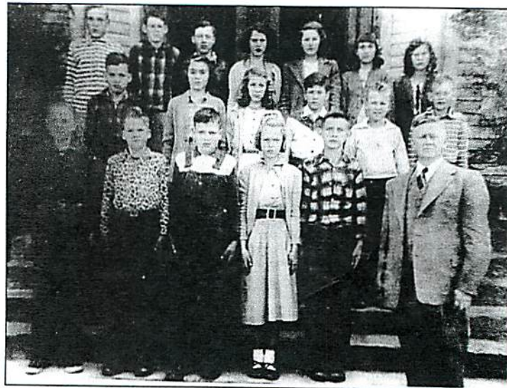
Rock Elementary School