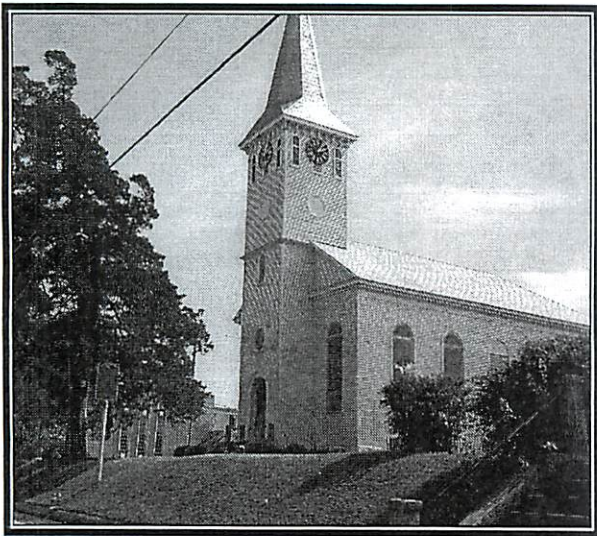
St. John's Evangelical Lutheran Church 301 West Main Street Walhalla, South Carolina 29691

Teacher's Report of Eighteen Mile, Salubrity Township, Pickens County. Located in the State Department of Education, Teacher Report file. South Carolina Department of Archives and History, Columbia, SC.