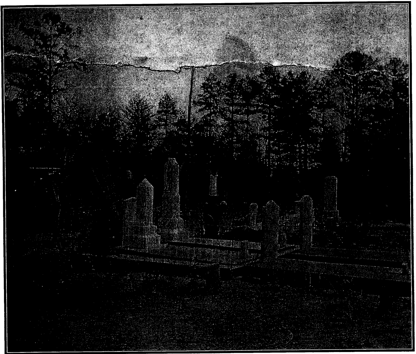
Clayton Collection at southern Wesleyan University From Edens-Lynch Collection