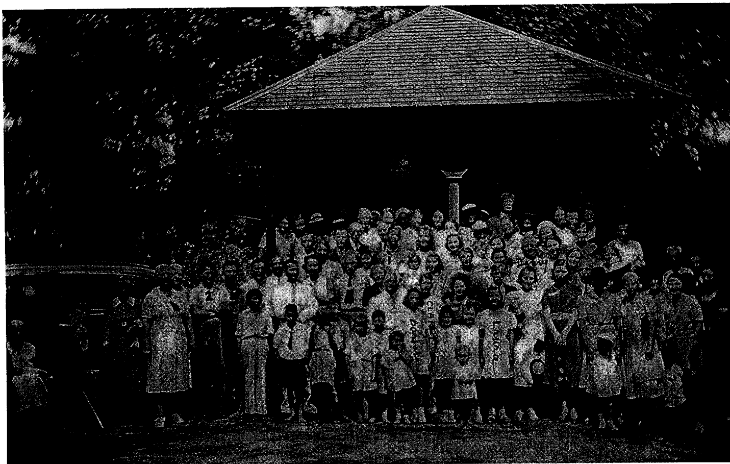
Smith Family Reunion, Williamston Park, Williamston, South Carolina July 18, 1940