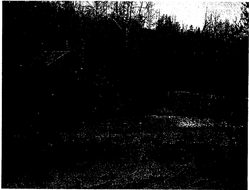
Symmes Mill and Dam on 18-mile Creek.

The dam is an older construction than our houses at Ashtabula and Woodburn, which plantations were both on 18-Mile Creek but were built in the later 1820's. Faith's Clayton ancestors had bought much of the Symmes' property from Dr. F. W. Symmes, and she has many old land plats which show fascinating details. The Symmes' property was not far from Ashtabula. Both were on the old road from Pendleton to