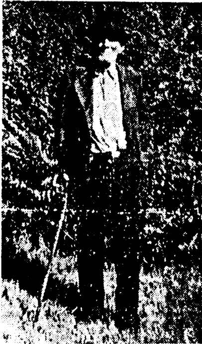
Age 98 years