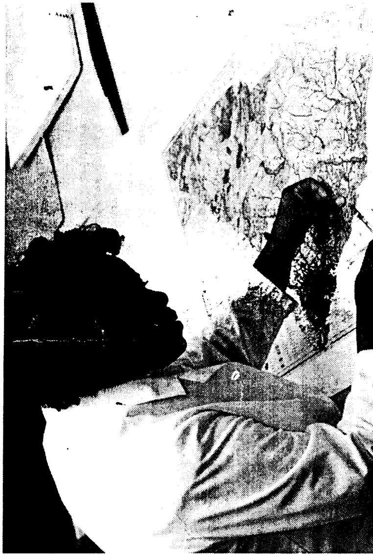
Document conservator Uju Emenike removes discolored tape from an old map. The Archives and History Conservation Lab has many techniques for repairing and preserving important documents.

Call (803) 734-8579 to set up a consultation with a document conservator.