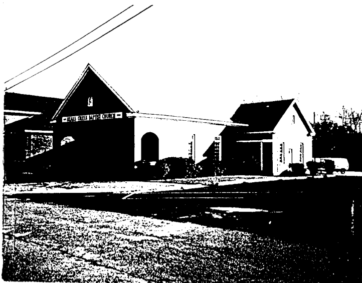
NEALS CREEK BAPTIST