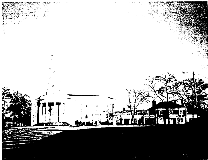
ANDERSON FIRST BAPTIST

This church started as Mount Tabor about 1\frac{1}{2} miles south of Anderson, SC a few hundred yards west of the Lowndsville Road. A few old tombstones mark the site. It has been used as a cemetery by the black people of Anderson. The present church is right in the center of Anderson facing on McDuffie St.